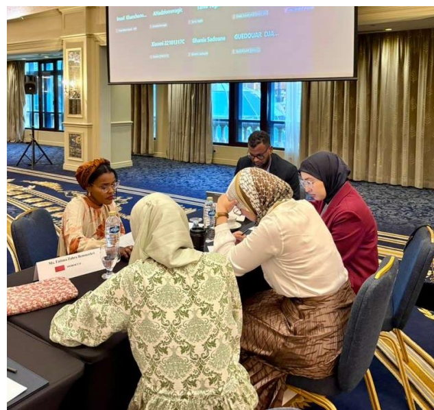
GFS hybrid regional workshop

(IFMIS) and PFM digitalization reforms in fragile and conflict-affected contexts. Officials clarified their national digitalization roadmaps, identified realistic sequencing approaches, and exchanged experience on integrating or launching IFMIS solutions under constrained conditions. Peer learning phased implementation and aligning digital solutions with country context.