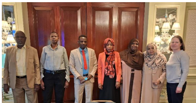
Sudan TSA mission.

Sudan advanced institutional and technical readiness to re-establish the Treasury Single Account (TSA) that collapsed because of the war. The Ministry of Finance and Economic Planning took stock of emergency banking and cash management arrangements introduced since 2023, presented progress in electronic revenue collection and interim digital treasury solutions and identified the remaining TSA reform prerequisites. With METAC's support, the authorities developed the first draft TSA Concept Note, setting out reform objectives, preconditions, a phased roadmap, and governance arrangements, while laying out implementation risks.