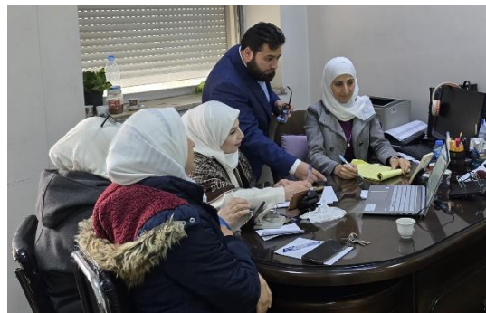
Syria Public Debt Management Mission

The Central Bank of Syria worked with METAC to identify key gaps in the regulatory and supervisory framework and defined priority actions across core areas. The Ministry of Finance strengthened its understanding of debt management practices by benchmarking existing arrangements against international principles. The engagement helped clarify priority reform gaps, particularly in domestic debt issuance, debt strategy formulation, and debt reporting and transparency, providing a clearer roadmap for future capacity development. In addition, Syrian tax authorities refined draft legislation on income taxation, sales tax, and fees and stamp duties, with policy discussions grounded in international experience and adapted to fragile and post-conflict conditions. The authorities also advanced budget preparation processes and passed their first budget for 2026.