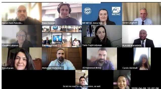
Regional workshop in IFMIS.

METAC member countries strengthened their capacity to compile and disseminate high-quality Government Finance Statistics (GFS) and Public Sector Debt Statistics (PSDS) aligned with international standards. Participants strengthened their understanding of advanced GFSM 2014 concepts, consolidation issues, and debt statistics compilation, with measurable learning gains and stronger readiness for regular international reporting.