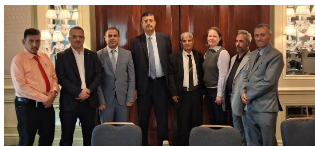
Yemen TSA mission.

The Palestinian Authority's tax administration is seeking to enhance its capacity in risk-based compliance and arrears management, which is particularly important under the current challenging circumstances. METAC trained staff on a focused compliance strategy aimed at supporting short-term revenue performance. Moreover, Palestine Customs aims to better understand how existing functionalities of its electronic customs management system, ASYCUDA World, can support revenue protection and enhanced compliance management. To this end, METAC conducted a functional review of the system to assess how PC can better leverage existing ASYCUDA World capabilities. Desk review supported an update of the Manual for Cash Management Directorate.