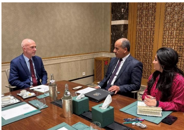
Scoping mission on the Governance and Anti-Corruption Capacity Development Needs in Libya.

Jordan made significant progress in implementing its electronic invoicing system: JoFotara, a reform to improve VAT compliance and strengthen revenue administration, with registration compliance rates at approximately 85 percent. METAC reviewed the implementation, its alignment with international standards, and progress in integrating invoice data into Income and Sales Tax Department. METAC also assisted the Department of Statistics in developing quarterly GDP estimates using the expenditure approach. An AML/CFT diagnostic mission supported the authorities in strengthening their use of financial intelligence to support money laundering and terrorist financing (ML/TF) investigations.