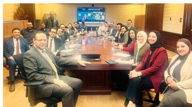
IFRS 9 hybrid mission in Egypt.

Expenditure Report, supported by improved institutional coordination, enhanced data sharing, and clearer validation of estimation methodologies.