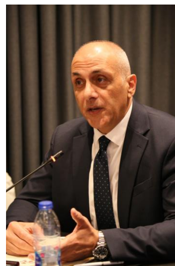
Jordanian Minister of Environment Dr. Muawieh Radaideh speaking to the participants during the opening session.

The 12 workshop sessions included lectures, discussion sessions, and participant presentations that fostered an interactive peer exchange. The workshop also showcased toolkits developed by the IMF to analyze the effects of different climate change scenarios on fiscal projections and public